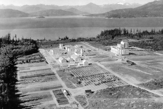
Aerial view of UBC's campus in 1925