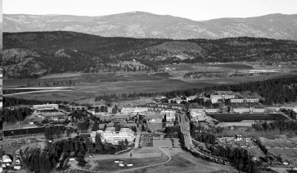
Recent aerial view of UBC Okanagan campus