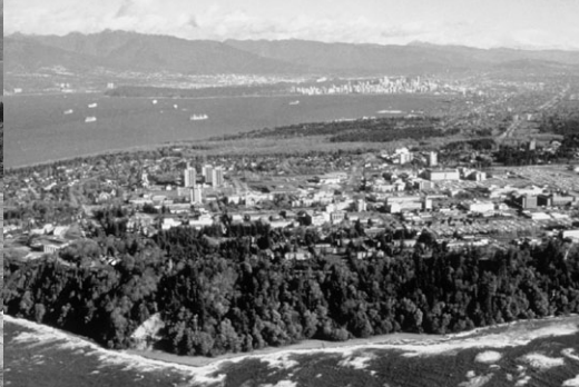
Recent aerial view of Vancouver campus